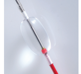
Atraumatic Coated Tip