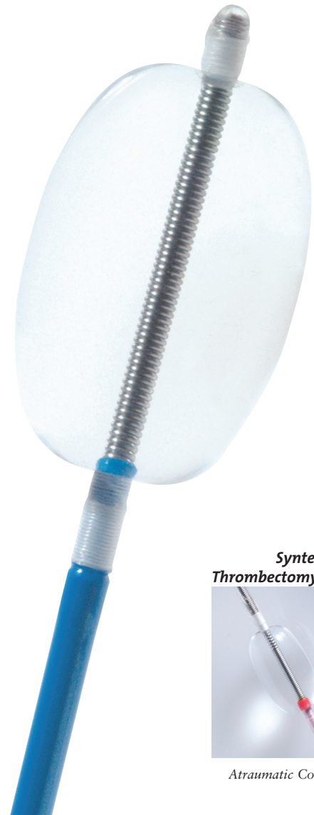
Syntel® Thrombectomy Catheter

Superior non-fragmenting balloon enhances clinical outcomes