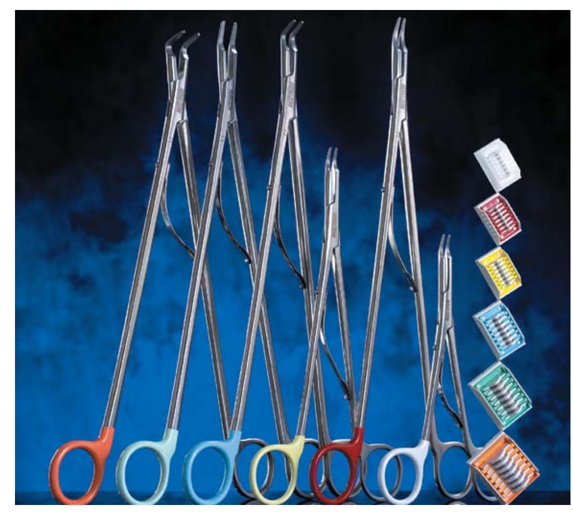
Horizon is designed to meet the needs of surgeons, nurses and other operating room personnel.